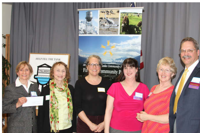
Members of the Mat-Su Community Chorus accepting their grant

To donate gifts of real or tangible personal property or stock, or to discuss planned-giving options, please contact us at: palmer@alaskacf.org or call 1-855-336-6701